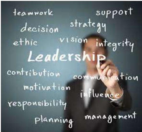
Value Stream Map your Systems!